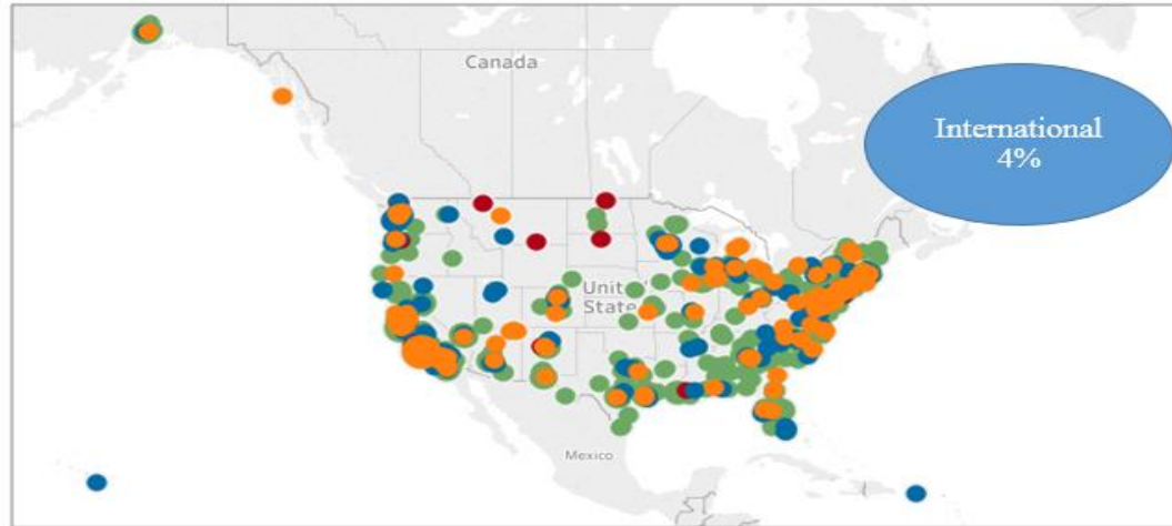
Figure 3: Fall 2016 Geographical Location